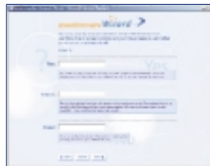
The Boomerang Wizard provides a step-by-step guide to setting up a questionnaire.