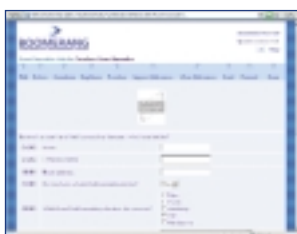
Preview your questionnaire before sending at the touch of a button.