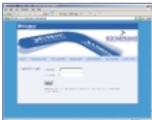
Boomerang User Login Page.